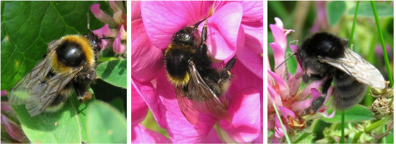
Bombus ruderatus showing progression from fully-banded worker (left) to all-black var. perniger worker (right).