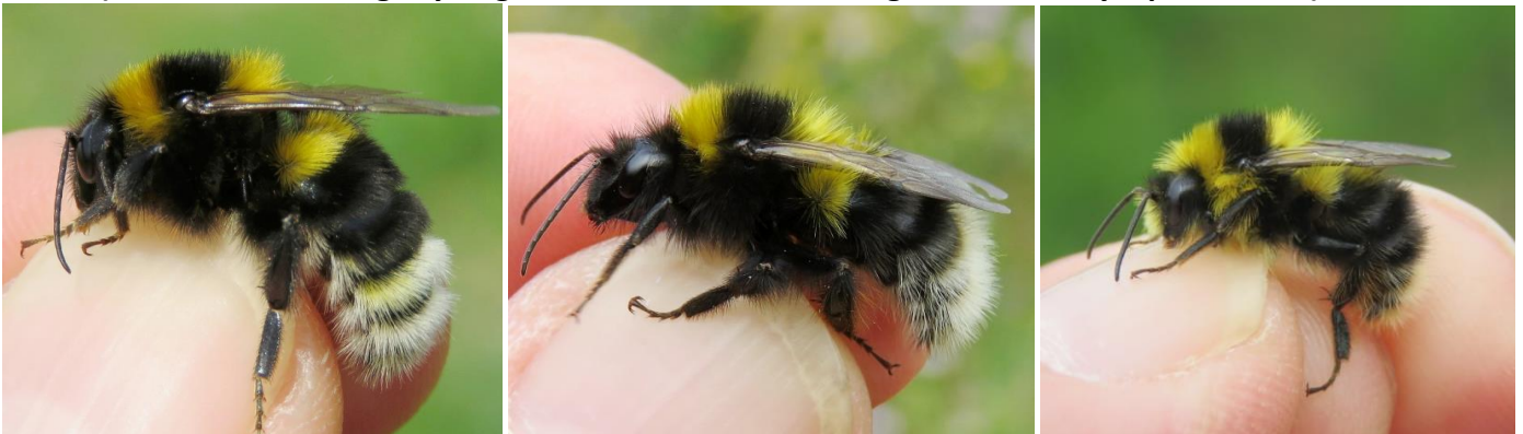
Banded Bombus ruderatus