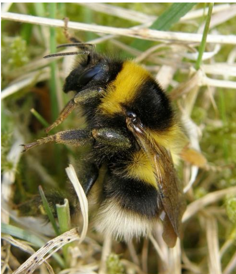
Typical Bombus hortorum