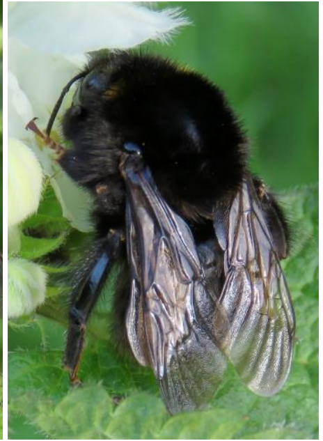
Typical Bombus ruderatus (left), semi-melanic (middle), all-black var. perniger (right).