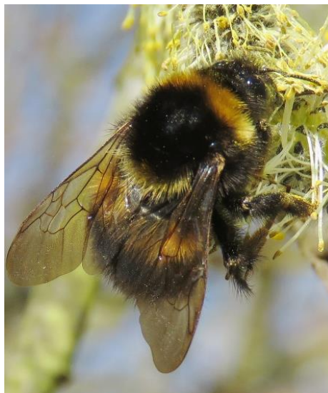
Darker B. hortorum