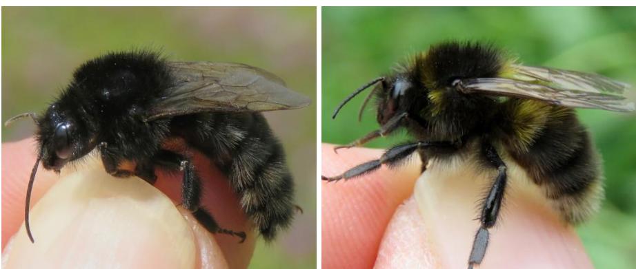
Bombus ruderatus var. perniger