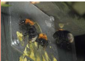
B. hypnorum nest in a bird box