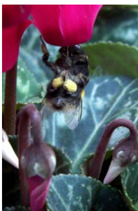
A worker of Bombus terrestris foraging at flowers of Cyclamen at Clapham Market.