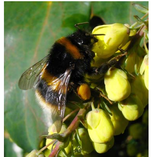
A worker of Bombus terrestris foraging at flowers of Mahonia